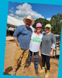
Photos from 2023 NC Carter Work Project